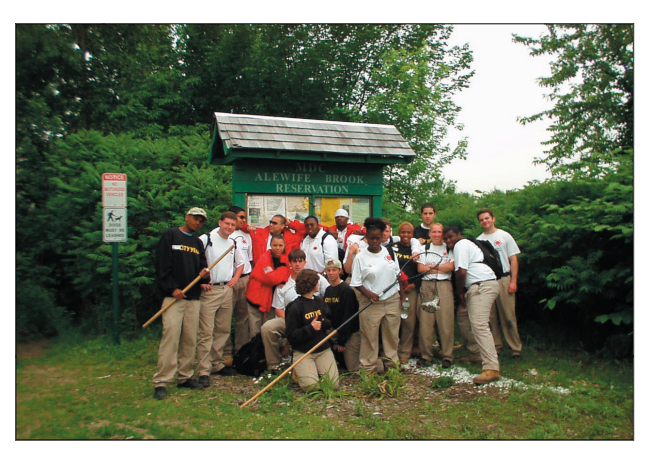
FIGURE 73. Teenagers displaying good stewardship of the Alewife Reservation by performing a trash clean-up.

Alewife Brook corridor. Educational materials could include brochures, newsletters, videos, models, and school curricula. After-school programs and guided tours will provide on-site education.