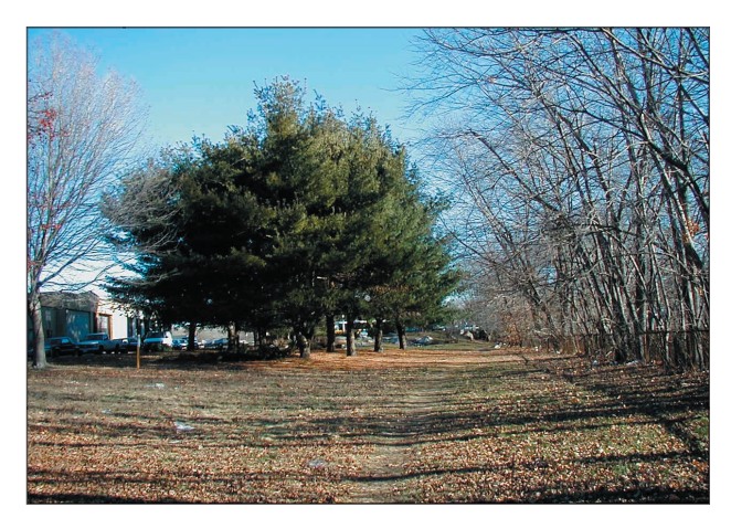
Figure 69: The greenway west of Alewife Brook is one of the three priority areas identified and will undergo detailed design in the next phase of planning.

The second project is the development of the Belmont Uplands adjacent to the Reservation