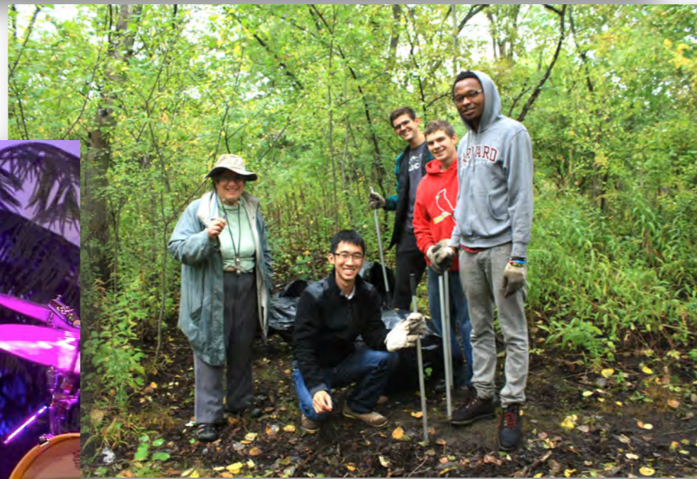
"Alewife Reservation Conservation" Poster Contest