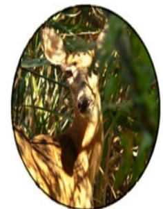
resident at the Belmont Uplands

Phone (optional): (____) _____ Email (optional) _____